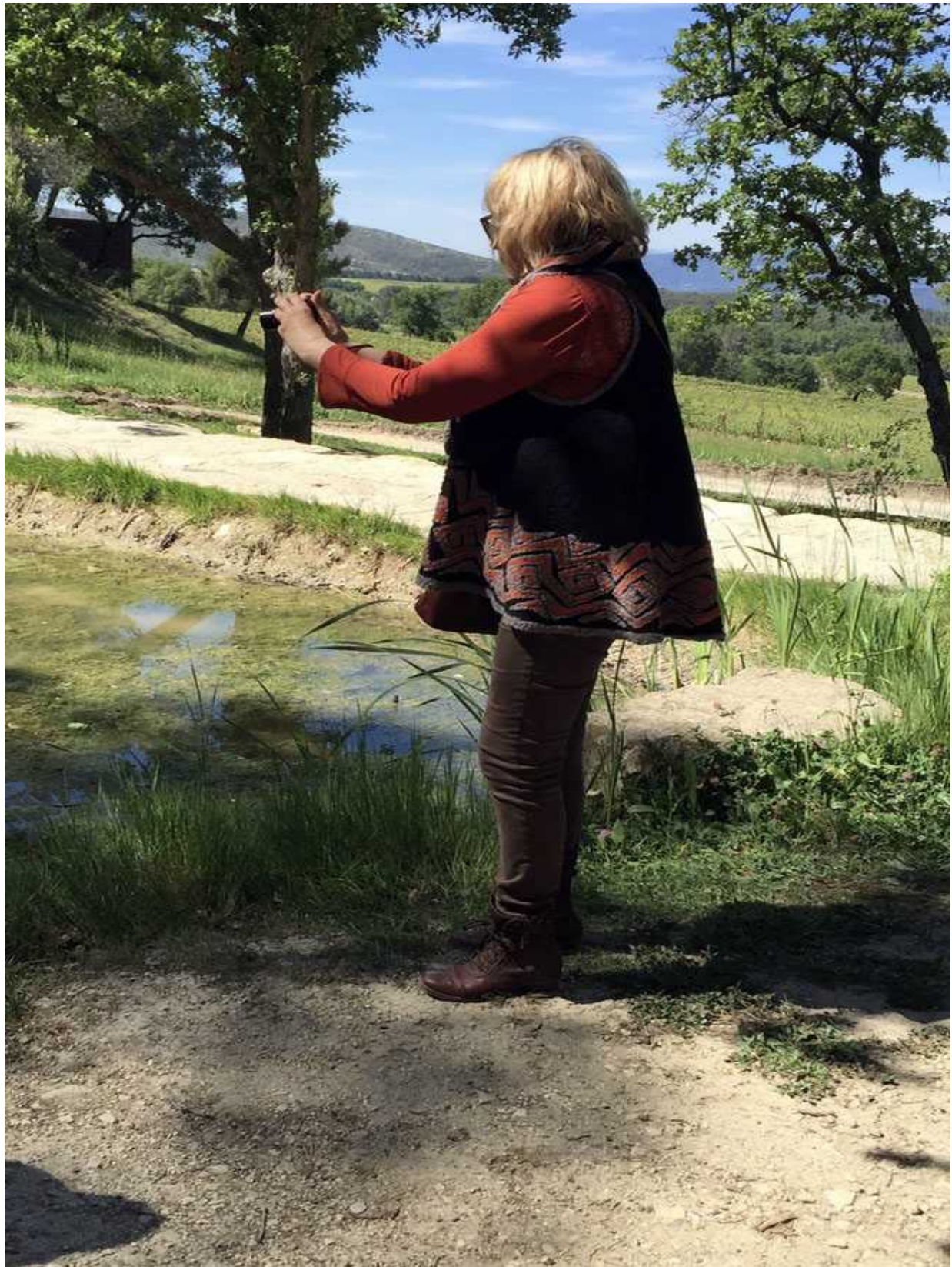
Photographing frogs in Chateau la Coste