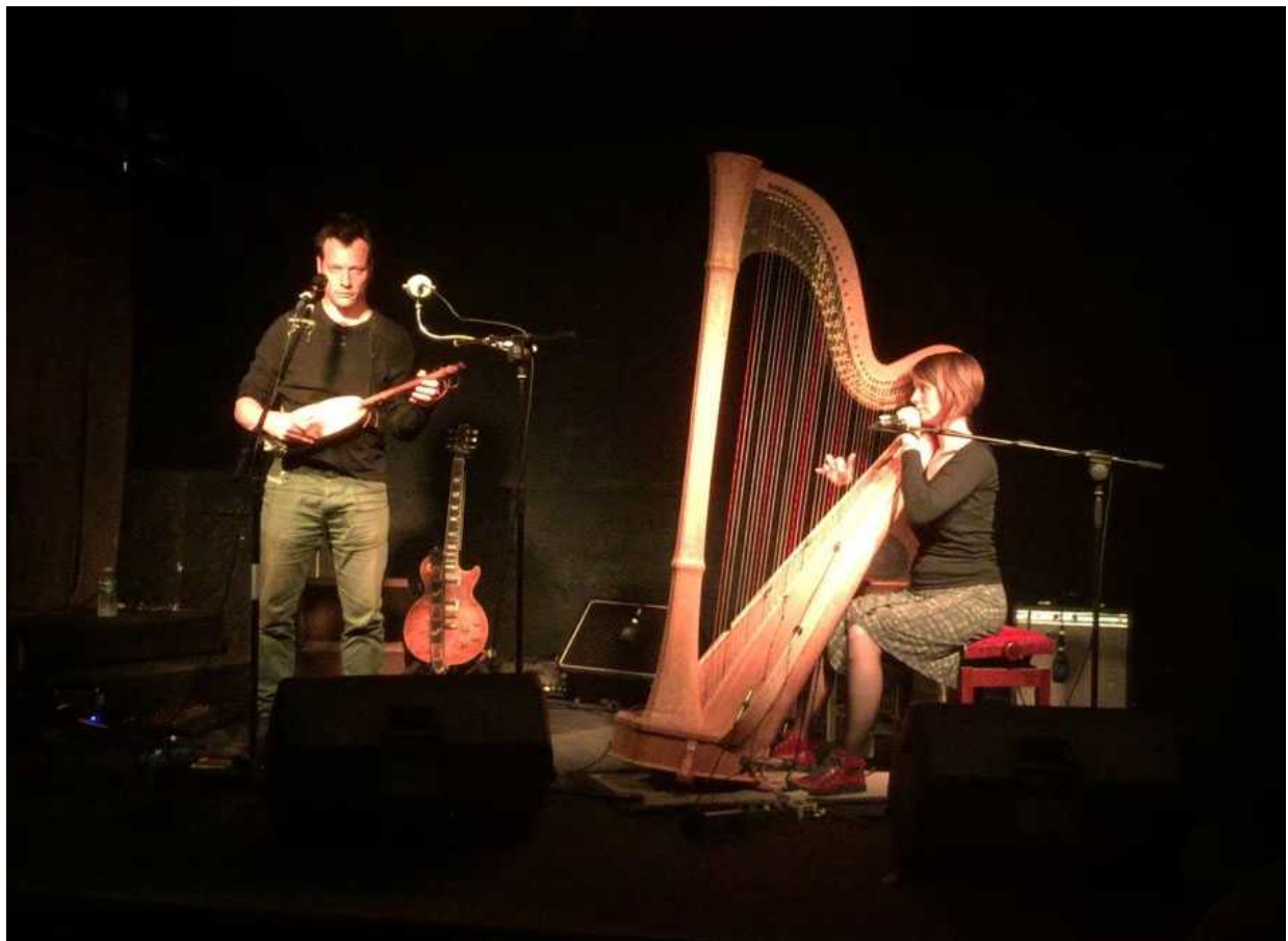
Concert in La Fabuleuz