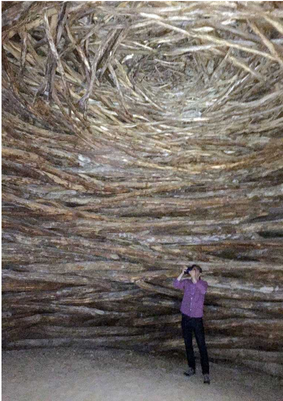
The bird nest in Chateau la Coste