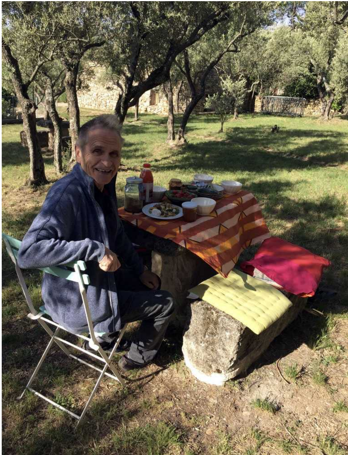
Breakfast in Rustel