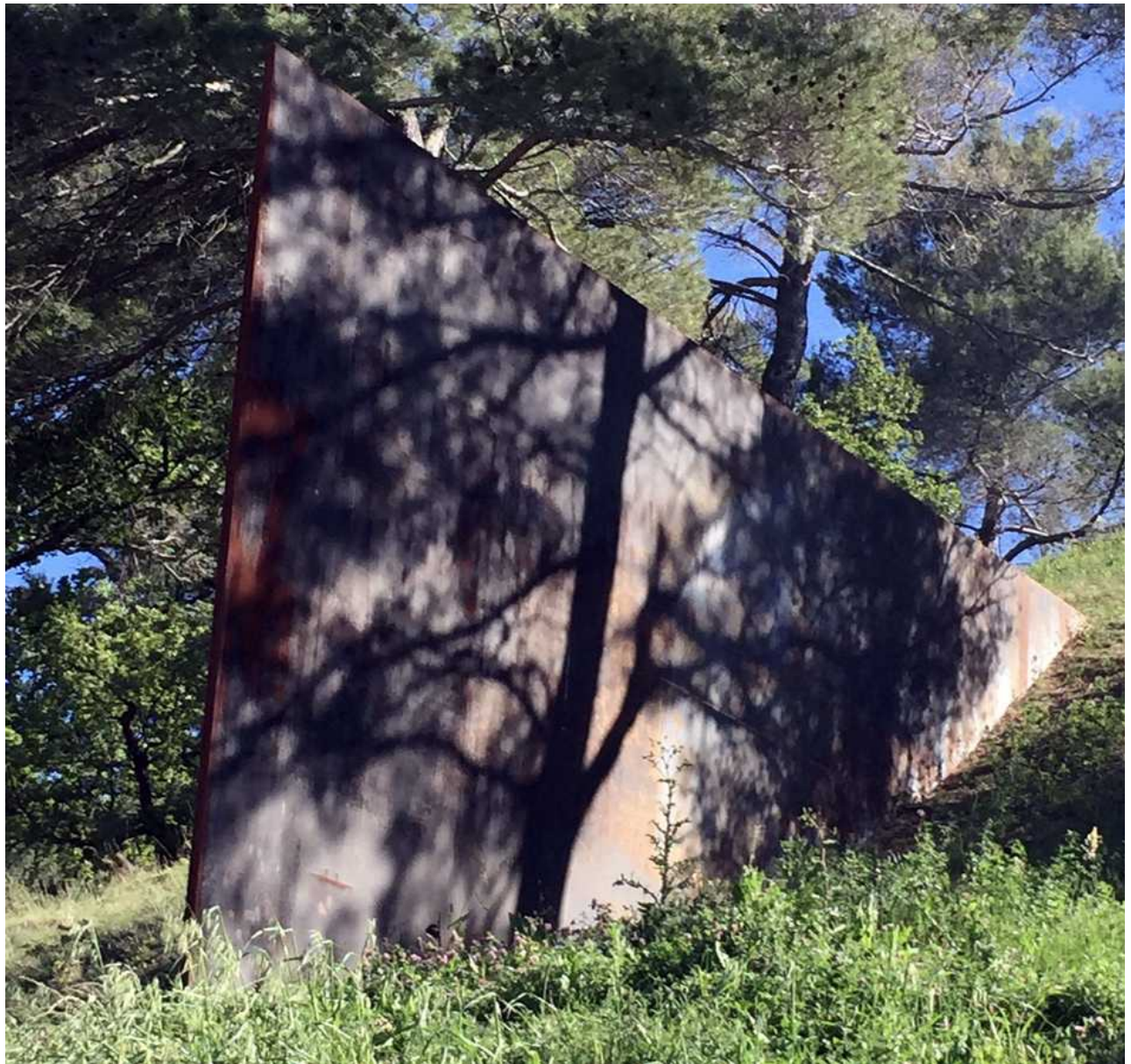
Shadow Play, Chateau la Coste, Provence.