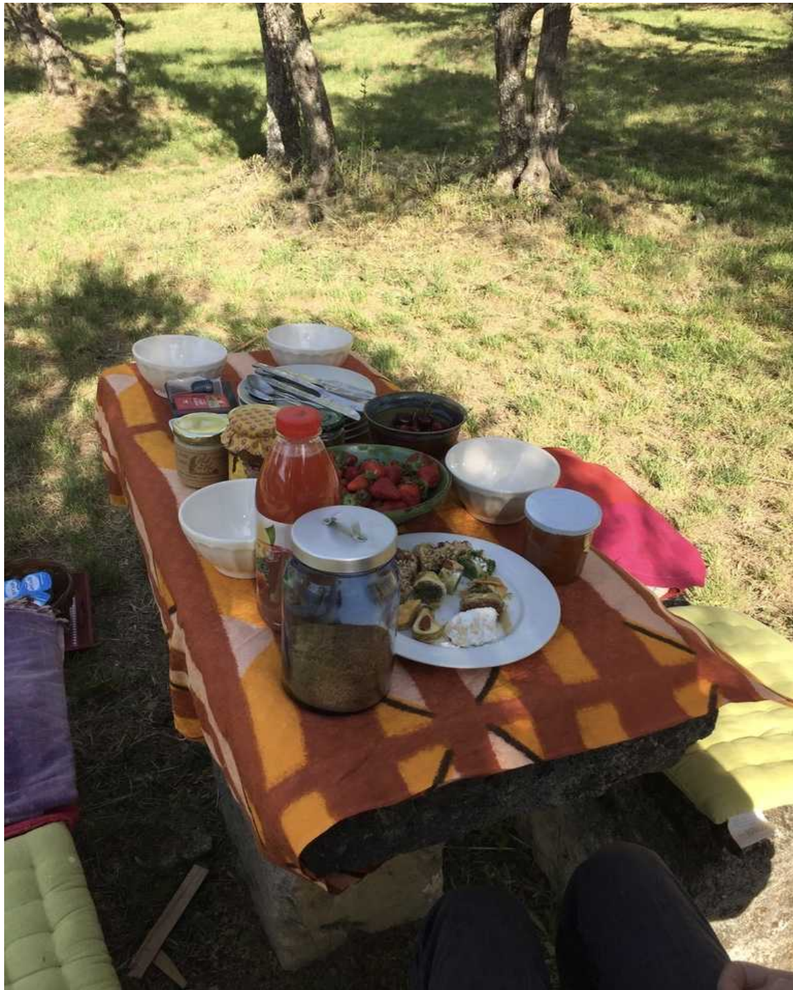
The morning feast