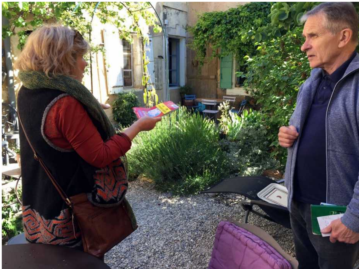
Making plans for the day